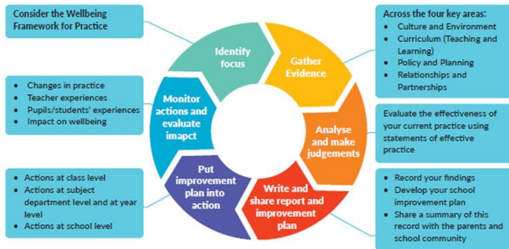
Table 6: Using the SSE process with the Wellbeing Framework for Practice

Wellbeing Promotion review and development cycle. We looked at our existing provision for wellbeing under each of the four key areas (culture and environment, curriculum, policy and planning, and relationships and partnerships) and devised and implemented a plan for improvement in one key area, as appropriate for our school. In devising and implementing the improvement plan, we will refer to the Statements of Effective Practice in key areas relevant to the specific focus we have chosen. We chose School Community as our theme with particular focus on RESPECT with each letter representing a various aspect of respect, pertinent to our school. We have explicitly taught these skills, implemented initiatives and monitored change. Pupils were consulted on their thoughts and opinions via Google forms and focus groups. Staff were also consulted via Google forms. From here we could observe common themes and from here recognise key priorities for our school.