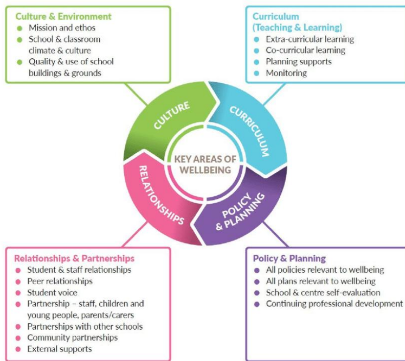
Table 2: Four Key Areas of Wellbeing Promotion